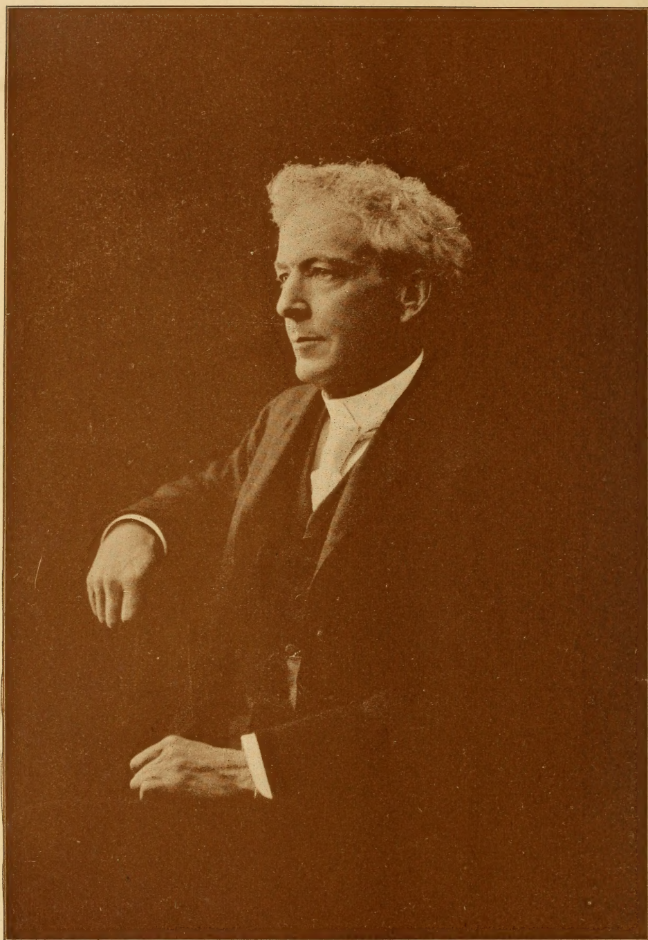
In all Europe there is no one who can even compare with Luther Burbank. A true worker must ever pay the price of genius.—Prof. Hugo De Vries, University of Amsterdam, Amsterdam, Holland.